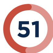
Private Funders Represented