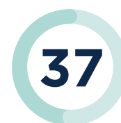
Research Institutions Represented