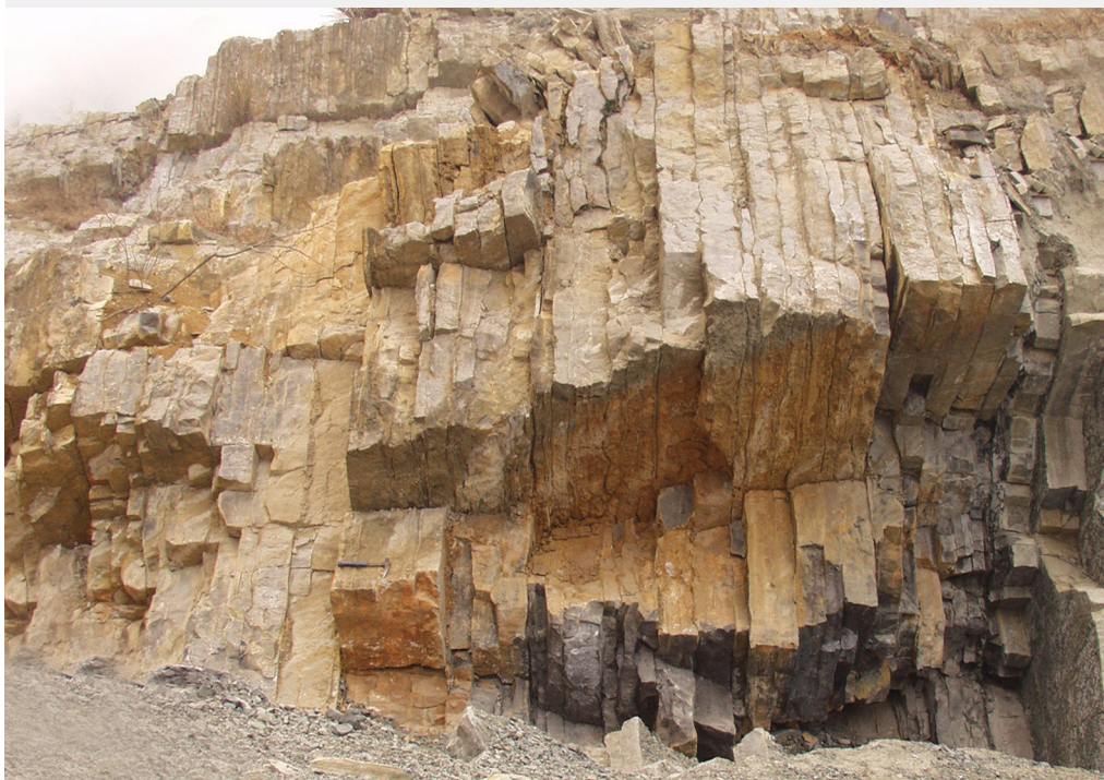
Sedimentary section in Meishan, China

For the modern carbon cycle, the principal problem concerns the fate of marine organic carbon that resists degradation for decades or longer. Two reservoirs are critical: dissolved organic carbon, which can persist for thousands of years, and sedimentary organic carbon, which can persist for millions of years. Imbalances in the carbon cycle are determined by shifts of these time scales or respiration rates. These rates are especially hard to determine when